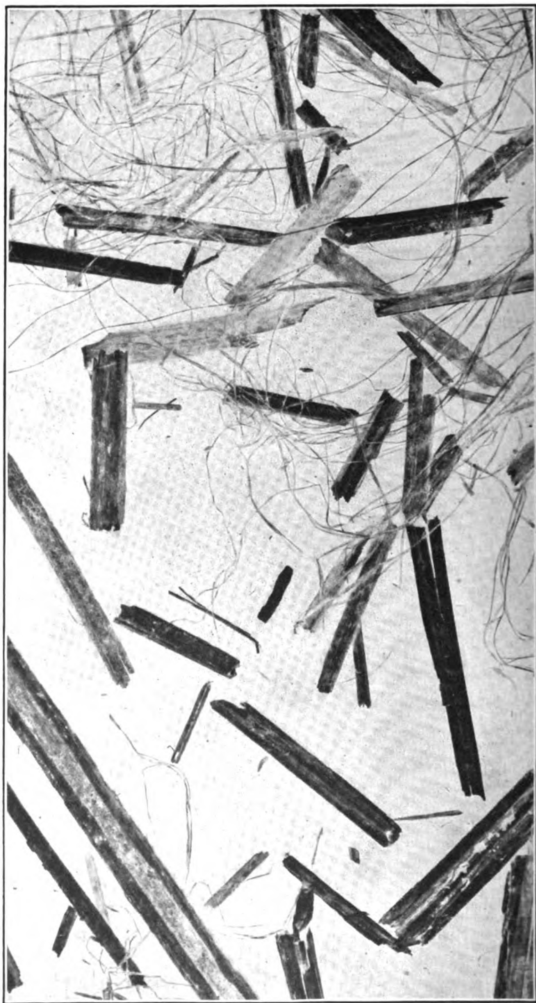
FIG. 3.—A representative sample of hemp hurds, natural size, showing hemp fiber and pieces of wood tissue.