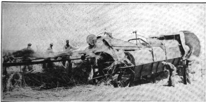
FIG. 1.—Hemp-breaking machine. The stalks are fed sidewise in a continuous layer 2 to 3 inches thick, turning out about 4,000 pounds of clean fiber per day and five times as much hurds.

The yield of hemp fiber varies from 400 to 2,500 pounds per acre, averaging 1,000 pounds under favorable conditions. The weight of