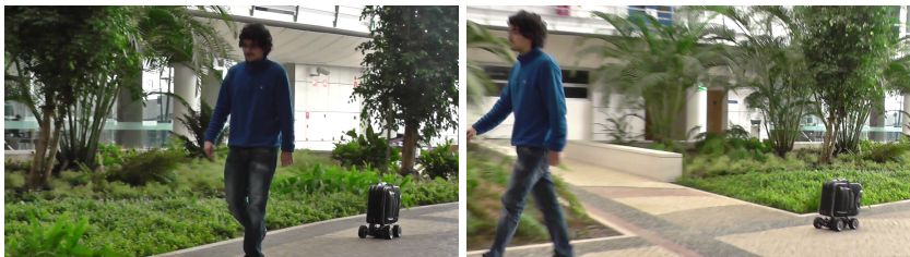
Fig. 3: Participant using aBag as his own robotic suitcase.

The fact that aBag was acting in different ways for the two interactions was not explicitly explained to the participants. The 7 participants that could not perform the whole experiment stopped the procedure at step (iv). 1