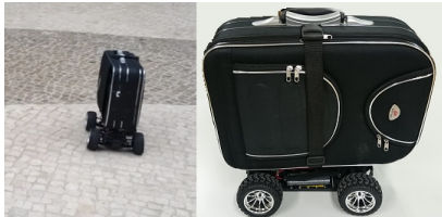
Fig. 1: aBag: front and side views.

designed to perform the same task as aBag. From what is available, it seems that this robotic suitcase is an autonomous version of aBag. Thus, the questions we pose in this work and the study performed become even more relevant and opportune.