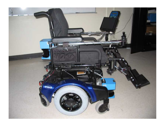
Figure 1: Autonomous Wheelchair

higher-level interaction and decision-making elements of the system. By shifting autonomy away from the user to the wheelchair, the user can control the system using high-level commands and take advantage of the low level robot control.