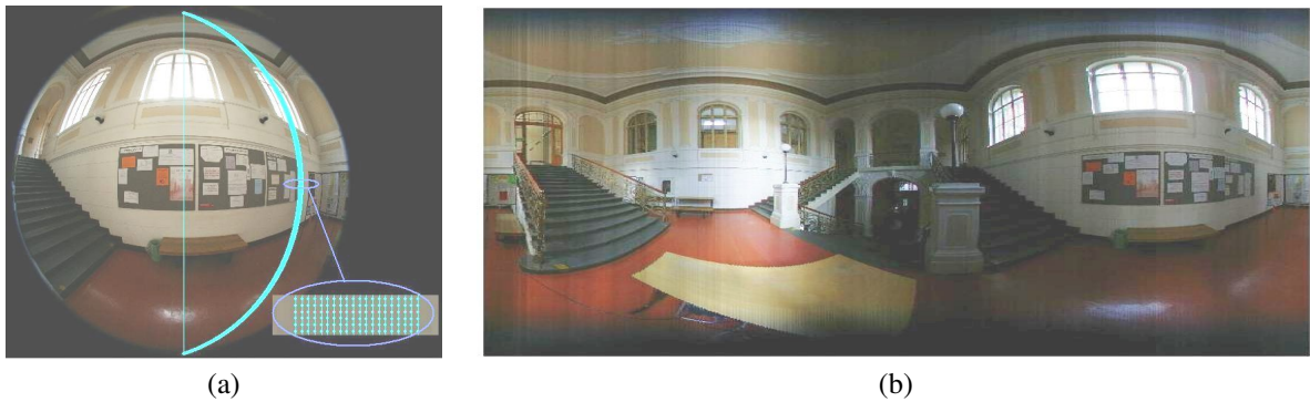
Fig. 2. Fisheye image and stripe that was estimated to generate a panorama (a). The panoramic image (b).

fixed in the camera local coordinate system, and thus variable in the world coordinates, {}^w\theta = \theta + i\delta , for i = 0..N - 1 . The most common mosaics are built with \theta = 0 , but by choosing two different reference azimuths, one builds two mosaics that have parallax information and thus allow estimating scene-depth [1]. In order to maintain the generality, we keep \theta in our formulation.