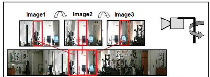
Fig. 1. Panoramic image being created using images captured with a regular camera rotating about an axis behind it.

Considering professional applications, is acceptable to use mechanical setups guaranteeing precise motion of the camera while allowing for more general camera geometries [3]. Researching the properties of these devices is certainly an enabling key for their widespread use.