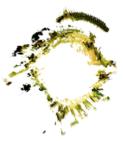
(b) Ground points used for registration (landmarks)