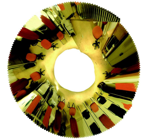
(c) Mosaic with all imaging data superimposed